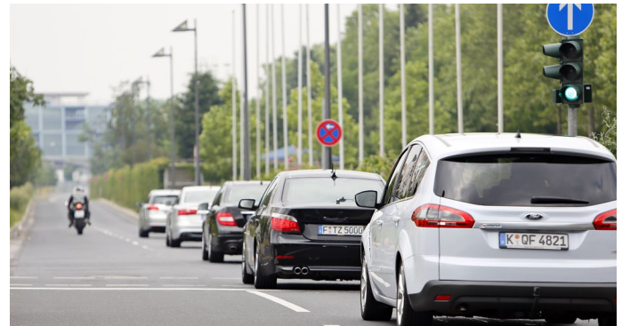
The demo vehicles at the starting point for the use case Emergency Breaking Notification.

The conclusion of sim TD is: car-to-x technology is contributing to make driving safer, more economical and more efficient.