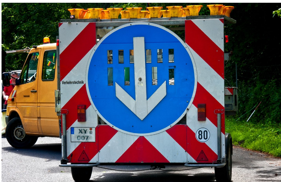
Road works warning trailers will be equipped with road side units exchanging data with passing vehicles.

The government of the cooperating countries makes allowance of this potential with a clear denomination to invest in the implementation of C-ITS in traffic infrastructure. Exclusively in Germany, roughly 300 Mio Euro will be invested in the implementation and operation of telematics services in traffic and transport. With the MoU approving the corridor project from 2015, the ministries signalise a close cooperation with partners from the automotive industry.