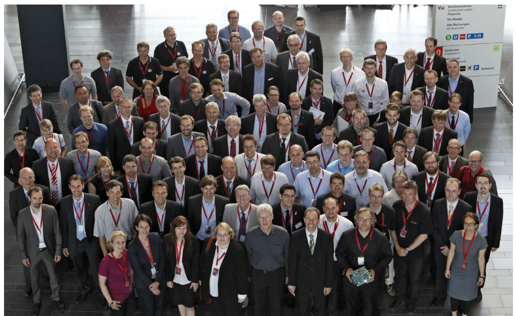
The sim TD Project Team.