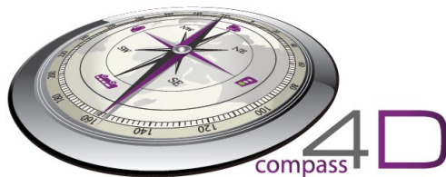
Piloting Cooperative Services for Deployment

The unique aspect of the project is that it will fully deploy the three services in all the seven pilot sites (Bordeaux, Copenhagen, Eindhoven-Helmond, Newcastle, Thessaloniki, Verona, and Vigo) and will be piloted for at least one year in 334 vehicles for a total of 550 drivers. This large fleet includes not only private cars, but also buses, taxis, electric vehicles, trucks and emergency vehicles. All these vehicles will be equipped with interop-